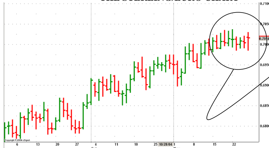
THE STERLING/EURO CHART

Last week the Pound largely moved sideways as Euro land data exposed that economy's own short comings.