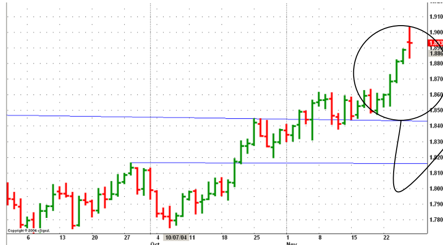
THE CABLE CHART

See how the Pound continued it's upwards march against the US Dollar, powered by the perception the US authorities will accept a weaker currency.