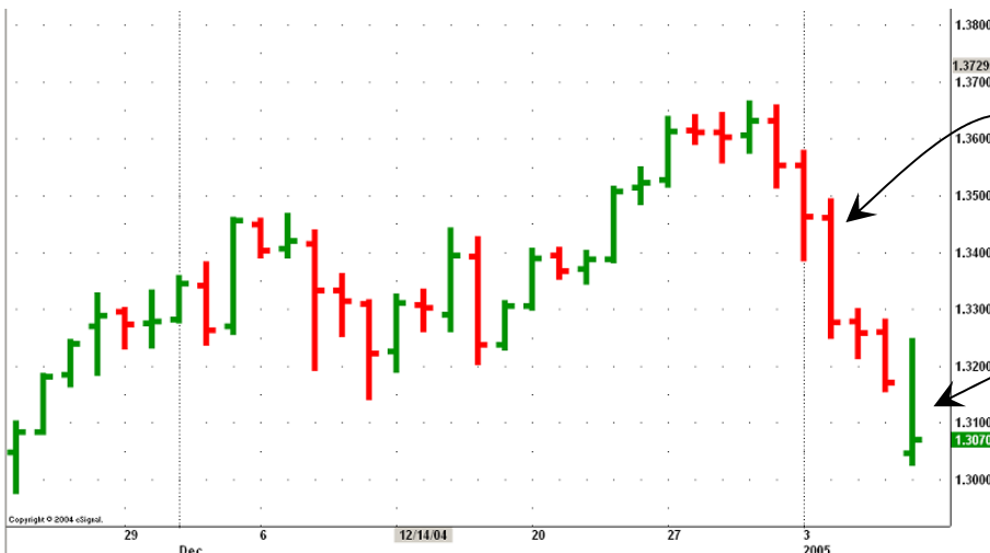
THE EURO/DOLLAR CHART

See how the Euro lost ground on Tuesday as the FOMC minutes sounded hawkish and then again on Friday after non-farm payroll.