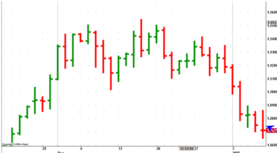
THE CABLE CHART

See how the correction hit my target of 1.86, almost on cue during Friday's trading. The retreat from the highs has been considerable over the last few weeks, but seems to have run its course.