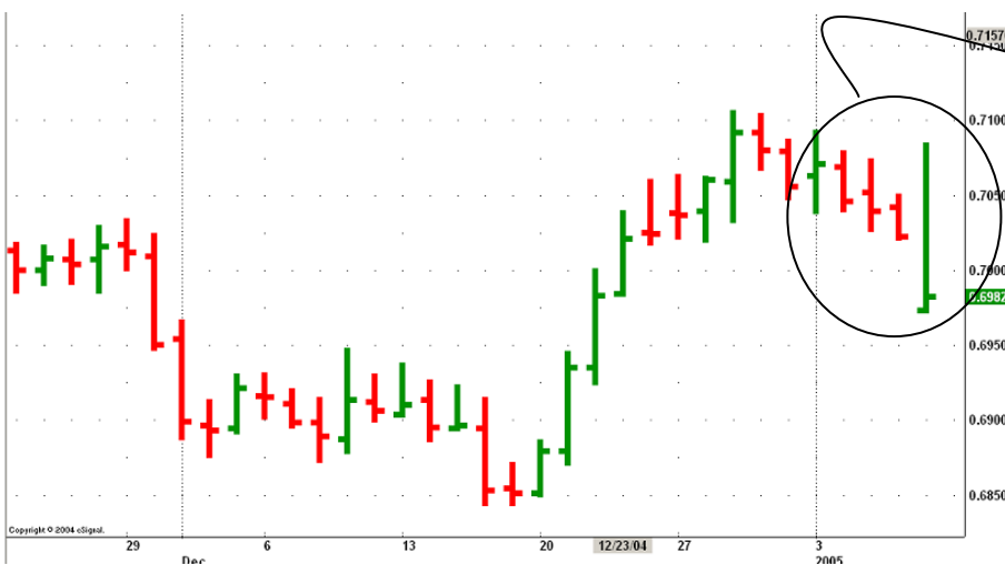
THE STERLING/EURO CHART

Note how Sterling benefited from the Euros slump against the Dollar. When the US Dollar resumes its slide against the Euro; so will sterling.